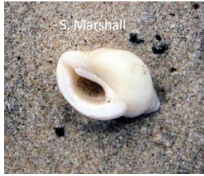
Dog whelk (with a groove in the mantle)