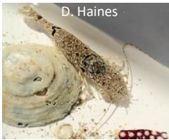
Brown shrimp (with limpet)