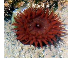
Beadlet anemone (feeding)